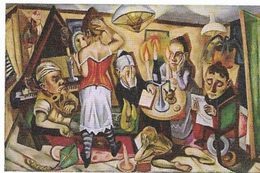
Max Beckmann (1884-1950) Family Picture 1920, oil on canvas 65.1 x 100.9 cm