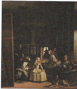
Diego Velázquez (1599-1660) Las Meninas 1656, oil on canvas 318 in x 108.7 in Museo de Prado, Madrid

For my comparative study, I have decided to look at these three artworks as they have similar contextual elements despite their considerably different time period. With two paintings one from the 17 th century and the other 20 th century and one photograph of the 21 st century, I will be able to analyze how each artists uses stylistic features to shape meaning.