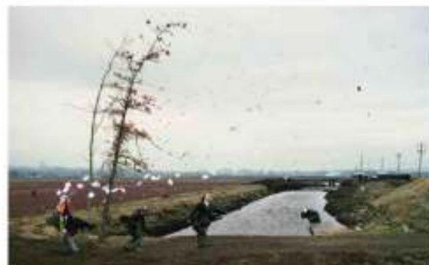
Fig. 2. Sudden Gust of Wind (after Hokusai) , Jeff Wall, 1993, 2500 x 3870 x 340 mm, Tate https://www.tate.org.uk/art/artworks/wall-a-sudden-gust-of-wind-after-hokusai-20105