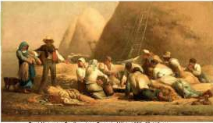
Fig 1. Harvester Resting , Jean François Millet, 1850. 67 x 118 cm, Musée d'Orsay http://collections.wikiart.org/fr/musee-jean-francois-millet/harvesters-resting-1853.jpg