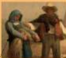
Fig 1. Harvester Resting, Jean-François Millet, 1850, oil, 119 cm. Musée d'Orsay http://upload.wikimedia.org/wikipedia/commons/0/0c/Jean-Francois-Millet-Harvesters-resting-1850.jpg

Tonal Difference Between Ruth and Boaz. There is heavier tonal weight comparatively on both these figures.