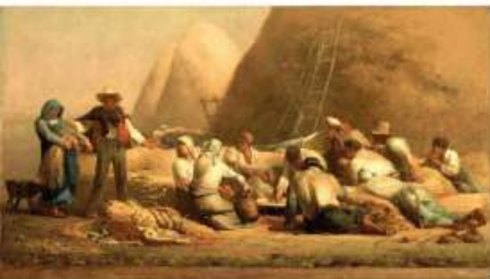
Fig. 1. Harvester Resting , Jean-François Millet, 1850, 67 x 119 cm, Musée d'Orsay http://apivizual.wikidat.org/images/jean-francois-millet/harvesters-resting-1851.jpg