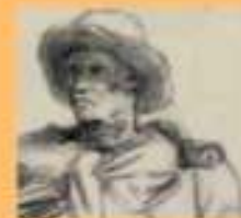
Pencil study of Boaz and his facial Expression

Boaz is placed between the peasant workers and Ruth. The colours used on him are grey for his trousers and a brick red for his jacket. In the painting we see Boaz inviting the reluctant Ruth (nudged by a dog) to join his harvesters for their meal. From here we can see that Boaz is grabbing Ruth as to show his power on her and the fact that he is a figure of higher social status than the others is resonated by the fact that he and Ruth are the only people standing. He is the only figure with both his arms extending also retreating his dominance.