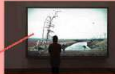
The Sudden Gust of Wind being curated after Hokusai b curated at the Tate Modern http://www.tate.org.uk/art/artworks/wall-s-sudden-gust-of-wind-after-hokusai-102691