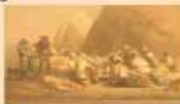
Fig. 1. Harvester Resting. Jean Francois Millet, 1850, 67 x 119 cm, Musée d'Orsay http://upload5.wikiaart.org/images/jean-francois-millet/harvester-resting-1853.jpg