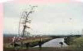
Fig.2. Sudden Gust of Wind (after Hokusai). Jeff Weil, 1993, 2500 x 3970 x 340 mm. Title http://www.1998.org.uk/art/artbooks/veel/a-sudden-gust-of-wind-after-hokusai-1995/

• The setting and the subject matter being workers. Asymmetrical composition with selected areas of greater weight and emphasis.