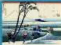
Fig. 3. Katsushika Hokusai. On a Sudden Storm is sudden gust of wind, color woodblock print, 1830-35. The Trustees of the British Museum. https://www.britishmuseum.org/learn/education/2014/01/hokusai-on-a-sudden-gust-of-wind-after-hokusai-1835

Colour: The colours used in this painting are mainly monochrom, light blue, white and green with a hint of blue. The use of colour is strategic and a majority of the painting is left white. Use of complementary colours such as blue and orange