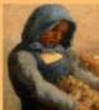
Close up of Ruth and her body language represents tragedy.

Ruth stands in the far right side of the painting dressed in blue that contrasts the golden and brown hues of the rest of the painting. The work is organised in such a way that the first thing that drew my attention is the figure of Ruth. She stands in the far right side of the painting dressed in blue that contrasts the golden and brown hues of the rest of the painting.