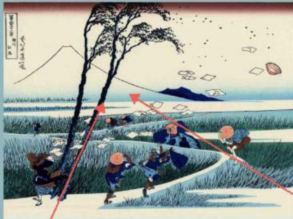
Fig. 3 Katsushika Hokusai. Eri in Suruga Province in a stormy gust of wind, colour woodblock print, 1832-33. The Trustees of the British Museum. https://www.britishmuseum.org/objects/1832-33-eri-in-suruga-province-in-a-stormy-gust-of-wind