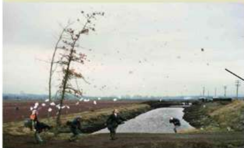
Fig 2 Sudden Gust of Wind (after Hokusai), Jeff Wall, 1983, 2500 x 3970 x 340 mm, Tate http://www.tate.org.uk/art/artworks/wall-a-sudden-gust-of-wind-after-hokusai-69860