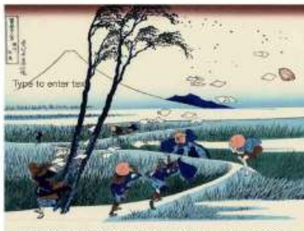
Fig. 3. Katsushika Hokusai, Eiji in Saruga Province ja sudden gust of wind , colour woodblock print, 1830-33, The Trustees of the British Museum. https://www.metmuseum.org/art/pressroom/2014/01/10/hokusai-sudden-gust-of-wind-1832-a-woodprint-by-katsushika-hokusai.jpg

During this investigation I looked at the portrayal of workers and members of everyday life. The portrayal of workers in a given painting reflects on the social and cultural context of the time. Millet uses the workers in "Harvesters Resting" as a social critique to appeal to the audience to recognise the dire state of the workers but makes the workers look heroic. A similar portrayal of the resilience of the workers in Hokusai's "A Sudden Gust of Wind" can be seen. Jeff Wall also shows the workers from Wall street in "A Sudden Gust of Wind (after Hokusai)" as a symbol of human urbanisation and puts them in a free rural environment making them look liberated.