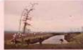
Fig.2 Sudden Gust of Wind ( after Hokusai), Jeff Wall, 1980, 2000 x 3070 x 340 mm., Tate http://www.tate.org/let/artworks/m/ja-a-sudden-gust-of-wind-after-hokusai-108851

Jeff Wall has been creating art from the 1970s till present. This work is influenced by the changing technology and the current affairs. In 1978 he created an installation "mimic" which highlighted the socio-cultural tensions between minority groups like Asians and white Americans.