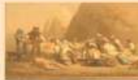
Fig. 1. Harvester Resting, Jean Francois Millet, 1850, 67 119 cm., Musée d'Orsay http://upload5.wikiart.org/images/jean-francois-millet/harvester-resting-no-1850.jpg

In the 1860s in rural France it was common to see these absentee Landlords who were desperate for personal gain far more than the welfare of other people. This painting referenced the Biblical Story of Ruth and Boaz in order to socially critique the lifestyle of the working class. Society neglected and looked over the hard work of the peasants and working class.