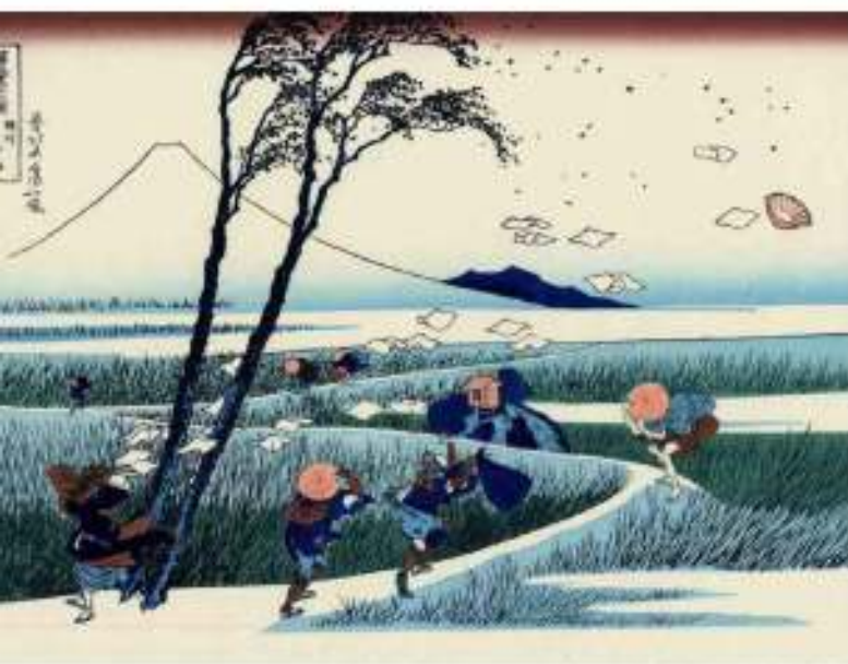
Fig. 3 Kabuki-ya Hokusai, Circa Edo Period (a wooden print of woodblock print, 1800-05, The Treasures of the British Museum, ID:00011045100.cais.file.nodatas.com/221453/kabuki-ya-a-woodblock-print-at-eth-cs-1532-a-woodprint-by-katsushika-hokusai.jpg